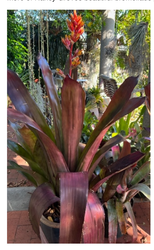
Aechmea 'Pinot Noir'

More of Nancy Groves beautiful bromeliads photos