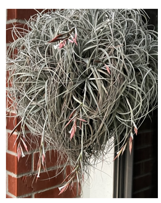
Aechmea del Măr'