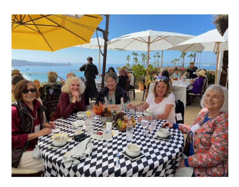
Smiling Faces at the Fall Brunch at the Chancellor's house on October 28