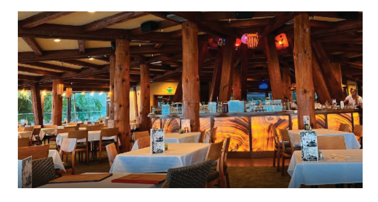
LOVELY BALI HAI

*Two additional board members will be elected at