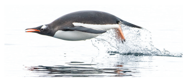
So jump at thchance !!