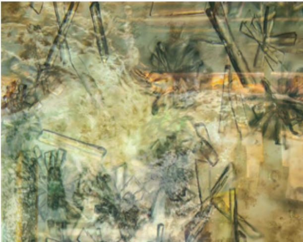
Microbes on a crashing wave