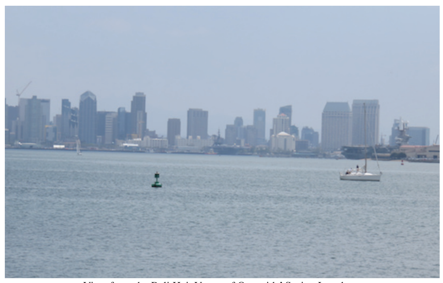
View from the Bali Hai, Venue of Oceanids' Spring Luncheon