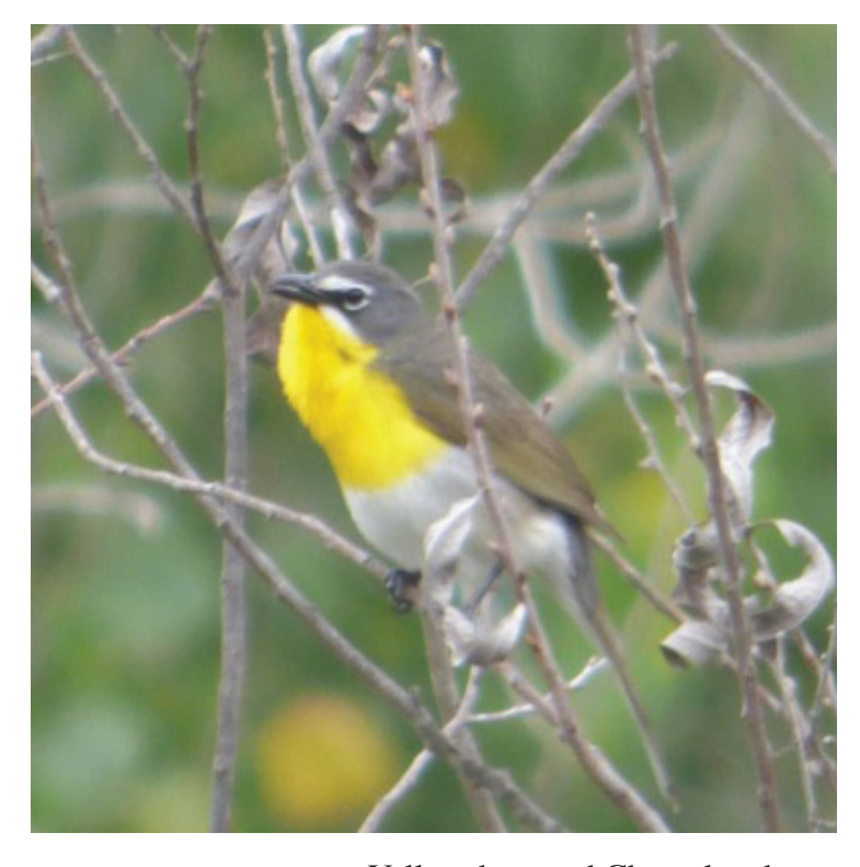
Yellow-breasted Chat

We have had a very good birding year, and although long time birders tell us that the total numbers of birds are down, we still see between 30 to 40 different species each time we bird. The thrill of seeing a specific bird for the first time is certainly one of the high points and many people keep their own personal "life"