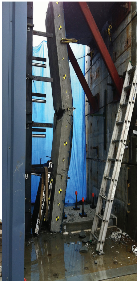
Bent through pressure blast