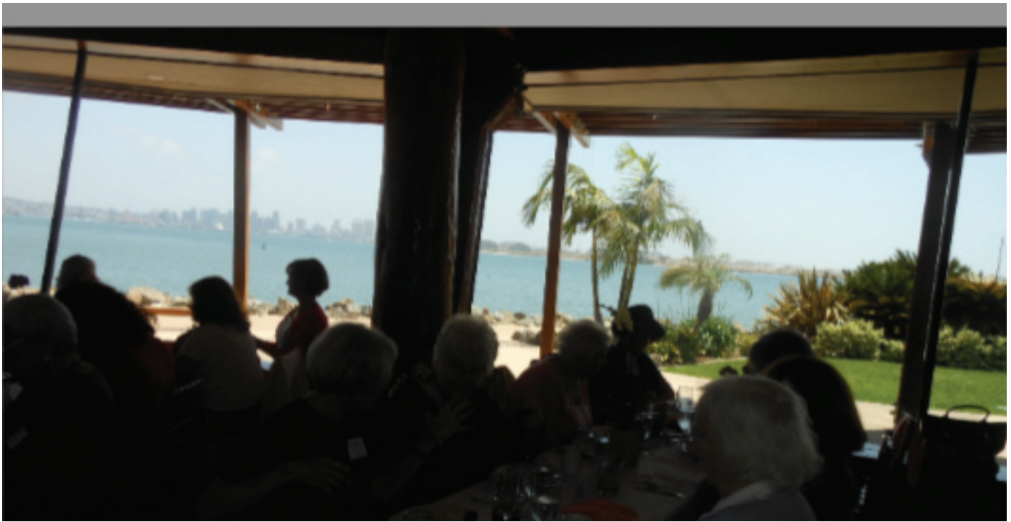
The beautiful setting of the Bali Hai Restaurant, location of the Spring Luncheon 2013