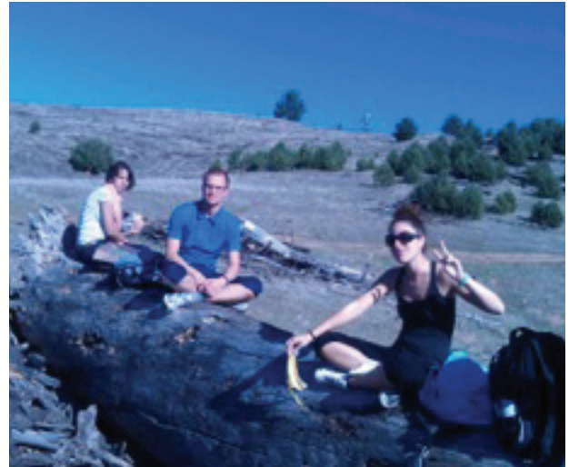
HIKING IS FUN !!!