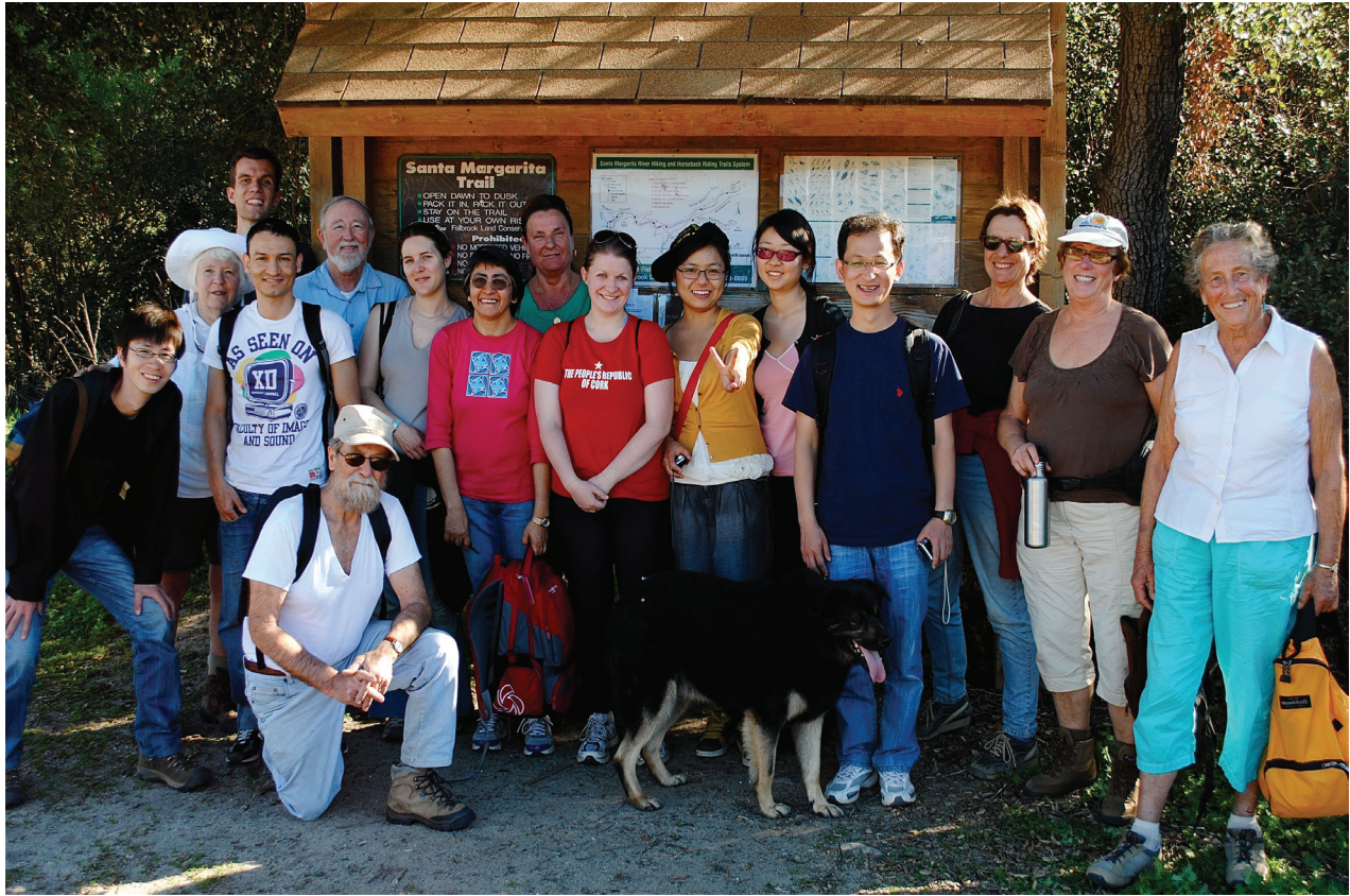
A fun time was had by the participants of the hiking interest group in February, trying to find the washed-out footpath along the Santa Margarita River.