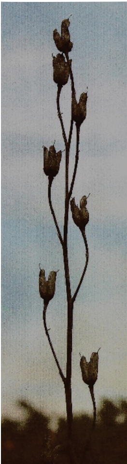
Scarlet Larkspur with seed pods, photo taken in the Torrey Pines Extension.

The scarlet larkspur lifts candleabra to sky to hail passers-by